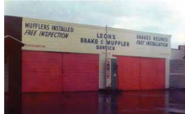
Leon's in 1961