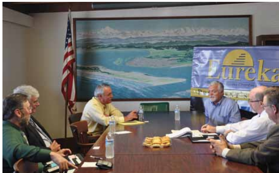
Assemblyman Wes Chesbro discusses business issues with Chamber representatives