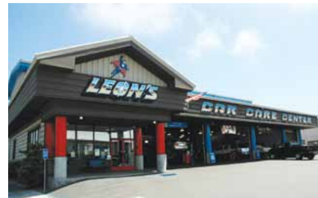
Leon's in 2011