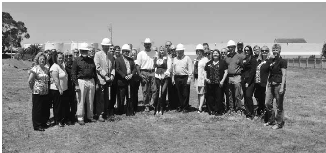
Groundbreaking for Eureka's newest restaurant, Shamus T. Bones

The bowling tournament was held on Saturday, August 6th at Harbor Lanes in Eureka.